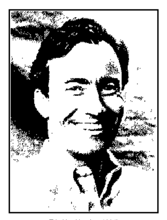
Trip Hawkins (ca. 1994)